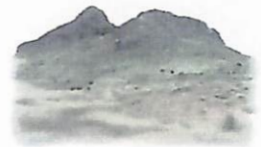
“Saddle Butte Mountain”

Phone: (928) 657-8042 – Fax: (928) 657-8046